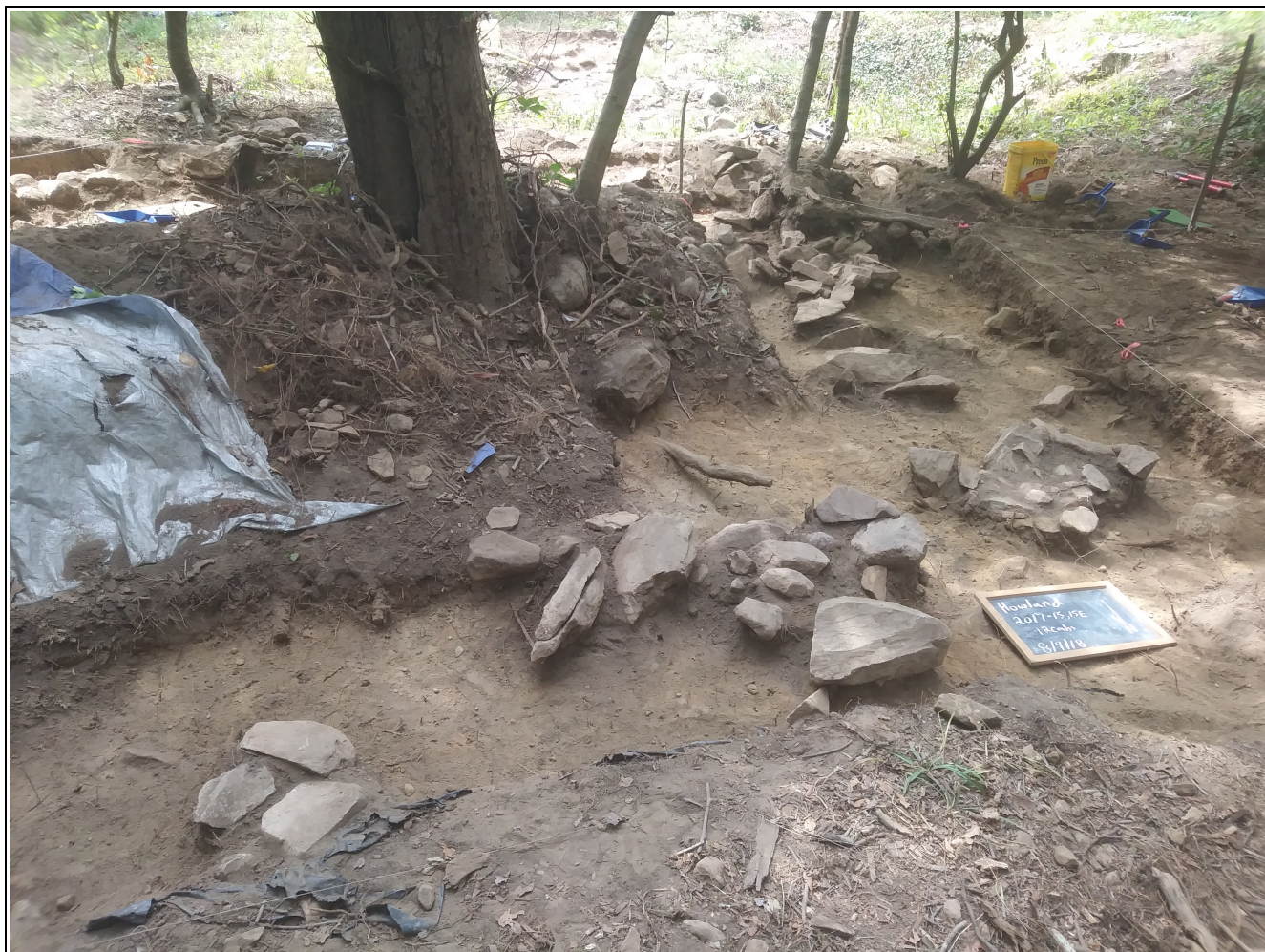
Figure 3. Northern end of 2018 excavation area looking southwest.