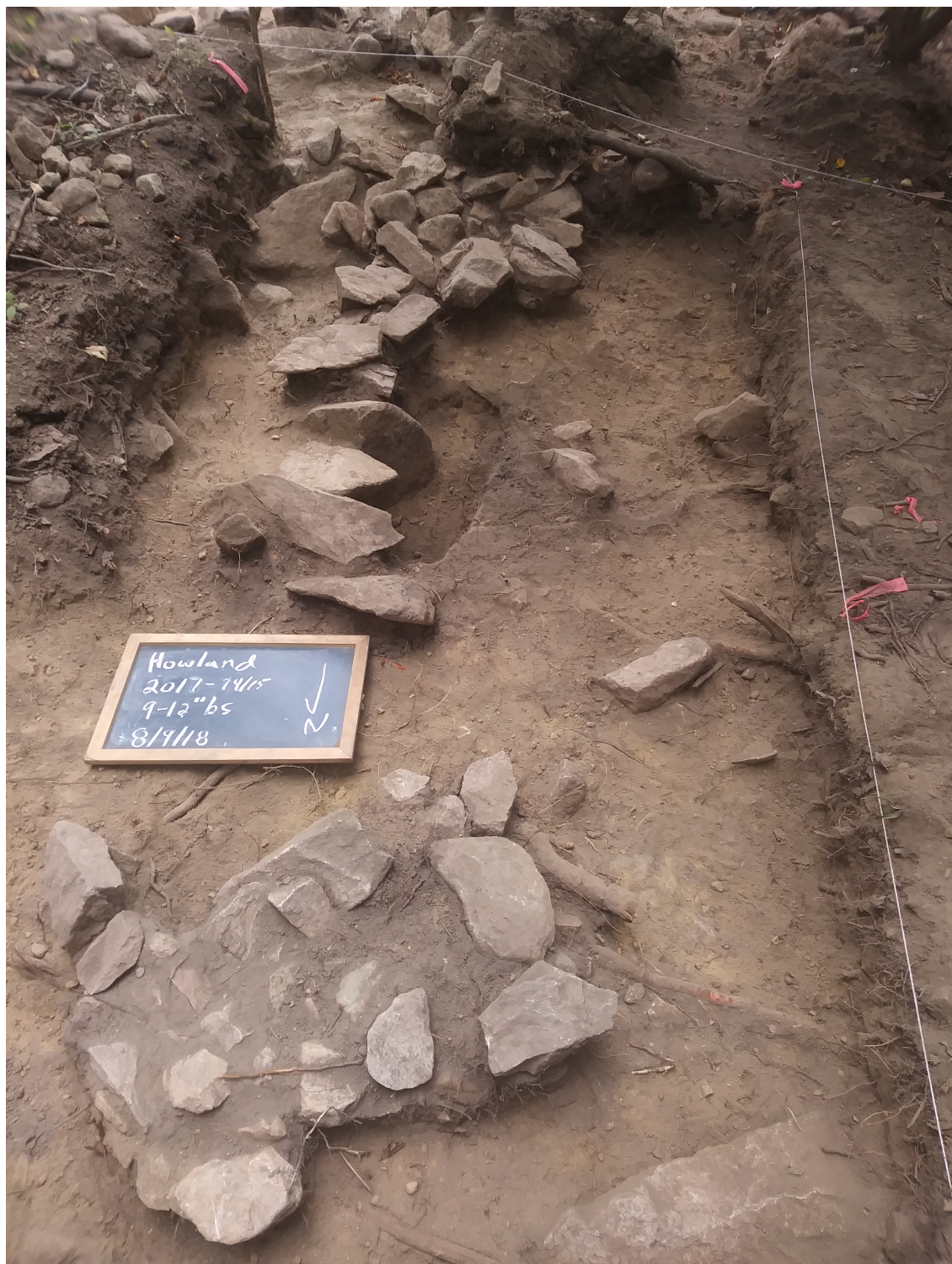
Figure 5. Western portion of the 2018 excavation area looking south (Feature 2 in the foreground).