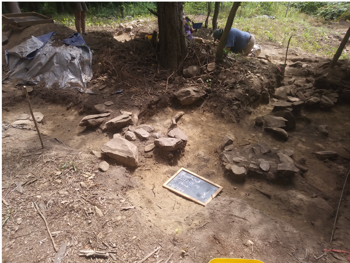
Figure 4. Northern section of the 2018 excavation area looking southeast (Ray Duffy in background)