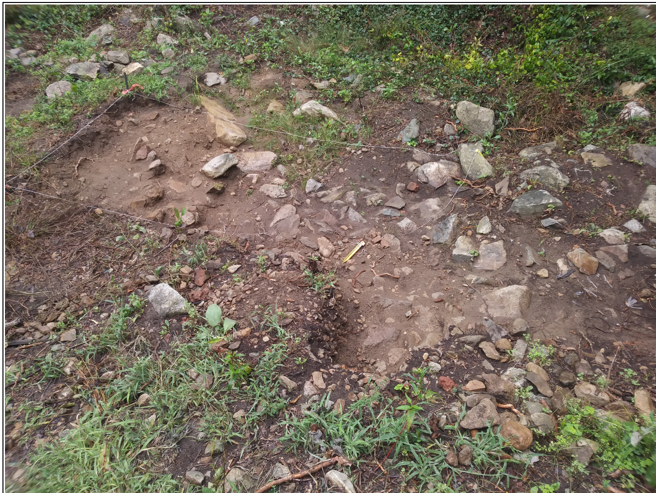
Figure 8. Southern portion of the 2018 excavation area, cobble and rock platform.