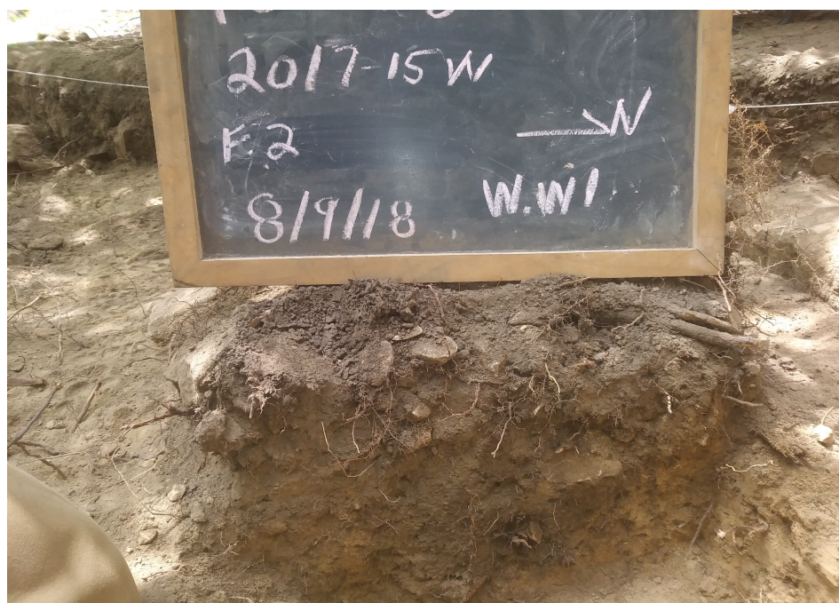
Figure 6. Feature 2 plan and bisection photographs.