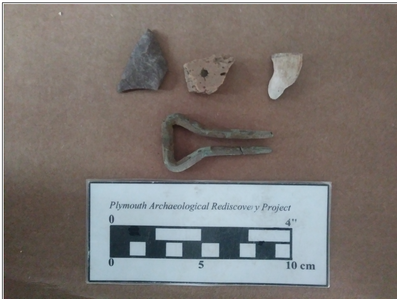
Figure 9. Significant 2018 artifact recoveries (Top Row Left to Right: Rhyolite Levanna point; Native Shell-Tempered pottery; Tobacco pipe bowl with rouletted edge; Bottom Row: Brass mouth harp.